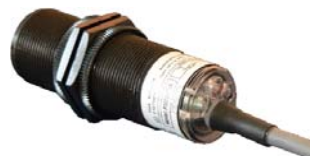
BS15V10AI OR BS25V10AI

Please refer to instruction manual for correct installation. Information subject to change or correction. February 2006.