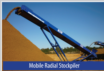
Mobile Radial Stockpiler