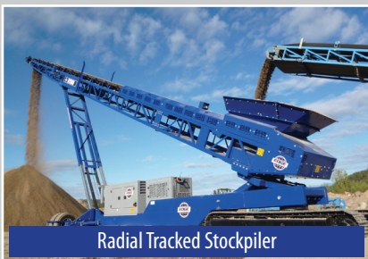
Radial Tracked Stockpiler