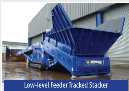
Low-level Feeder Tracked Stacker