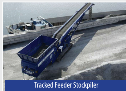
Tracked Feeder Stockpiler